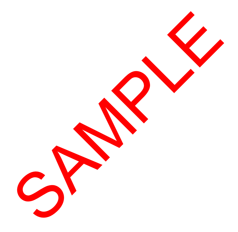
Exhibit D Contractor's Certificate(s) of Insurance