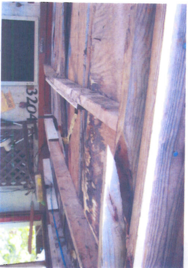
3204 39th St. E., Palmetto, FL