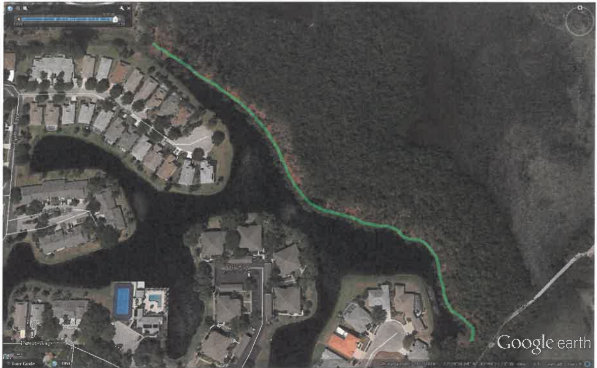
Figure 1 – Connector Parcel Planting – Project Location Aerial