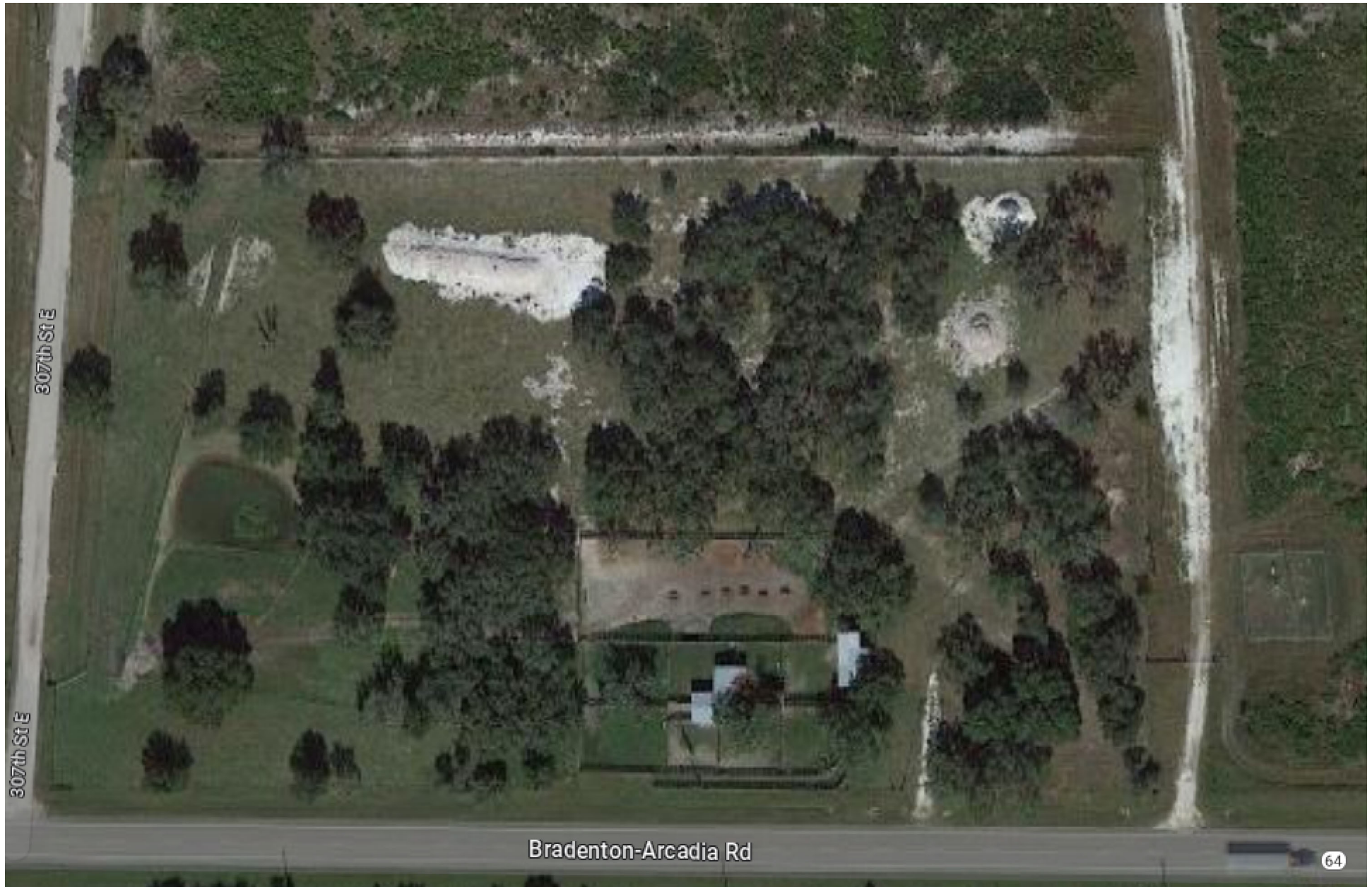
EXHIBIT 3, SITE MAP