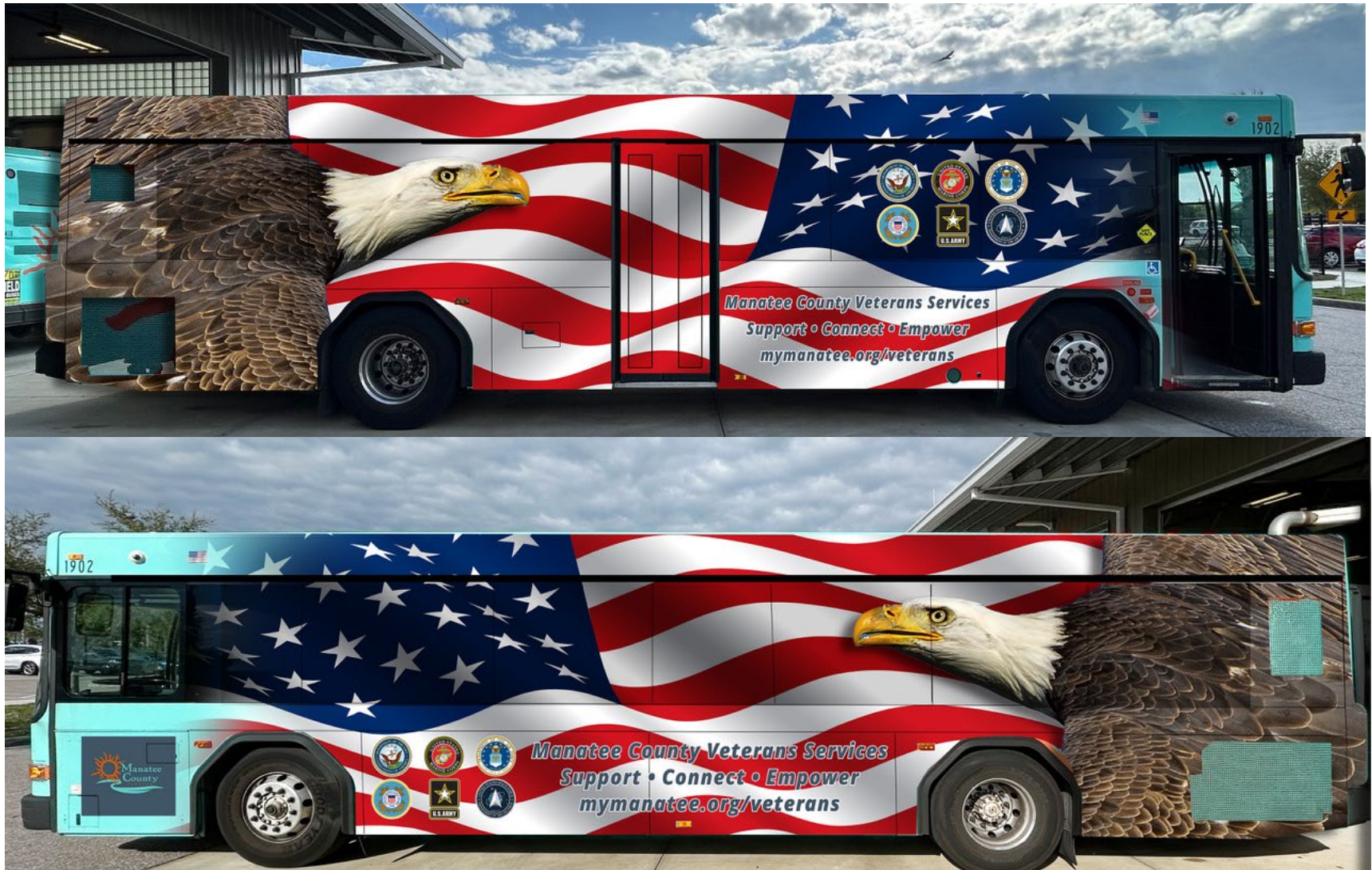
Exhibit 4, 35 Foot Gillig Bus Vinyl Wrap Design and Schematic IFB No. 24-R084572AF