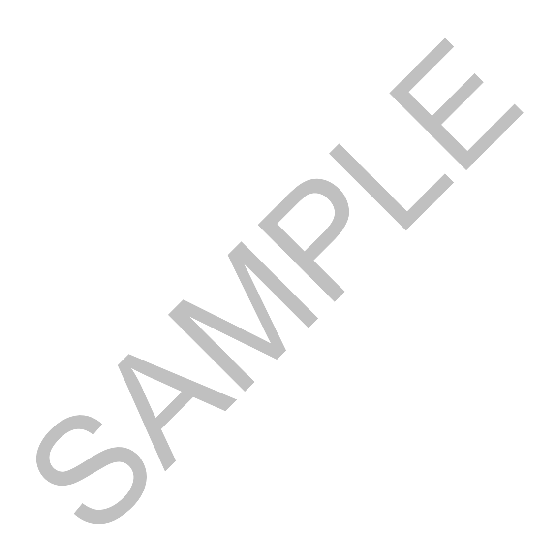
Exhibit A <u>Title(s) of Drawings</u>