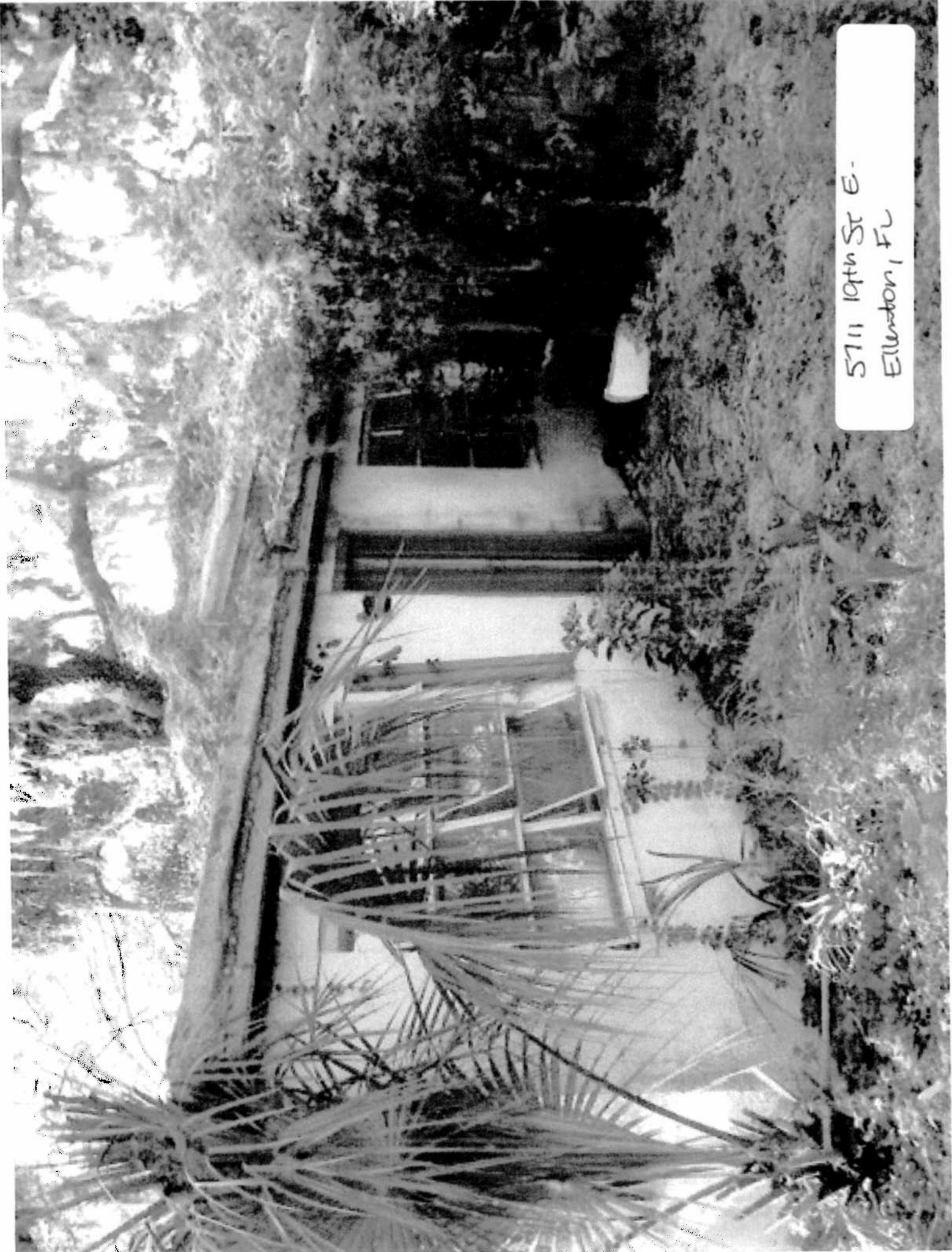
5711 19th St E- Ellenton, FL