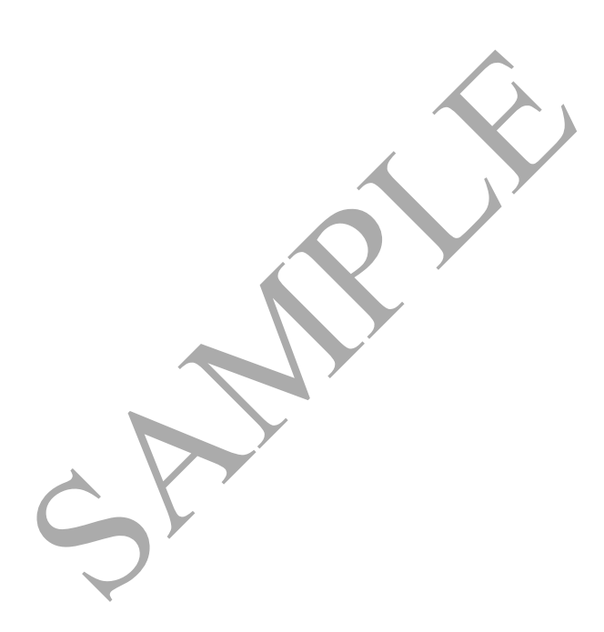
Exhibit A <u>Title(s) of Drawings</u>