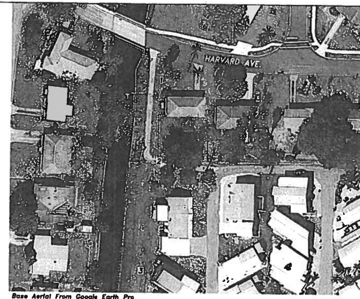
TEST BORING LOCATIONS