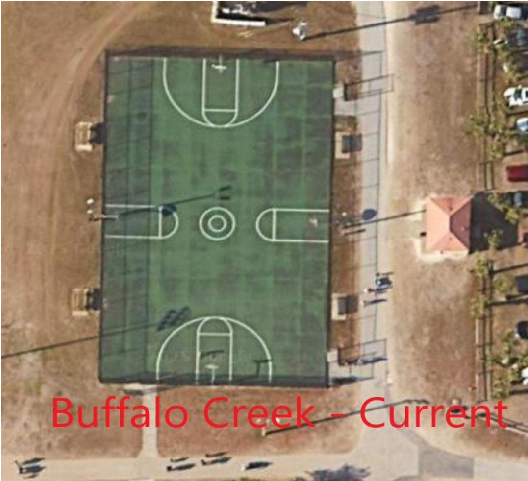
EXHIBIT 3 – PROJECT MAP