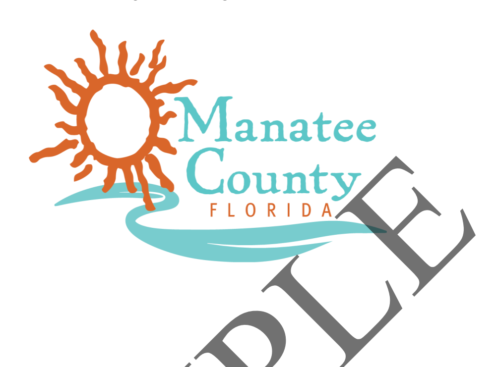
EXHIBIT 3 SAMPLE AGREEMENT