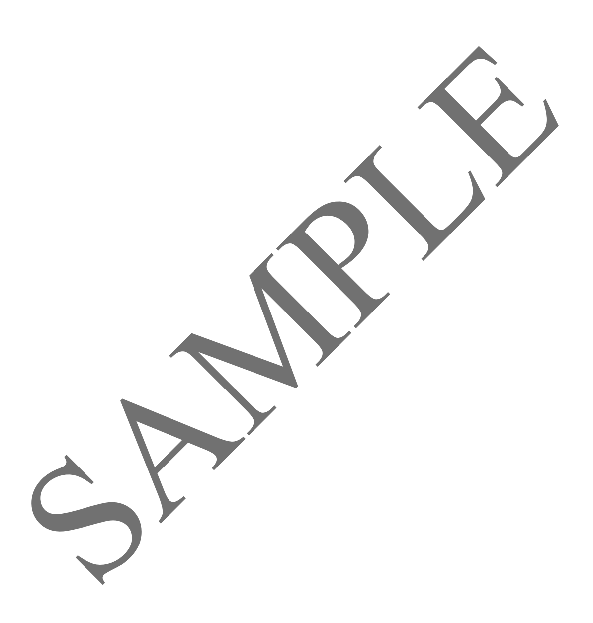
EXHIBIT A SCOPE OF SERVICES