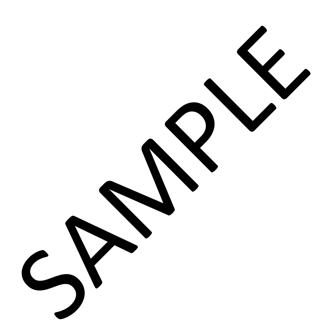
Exhibit A <u>Title(s) of Drawings</u>