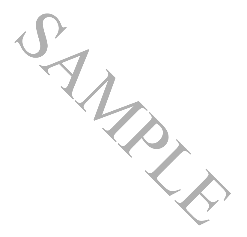
Exhibit A <u>Title(s) of Drawings</u>