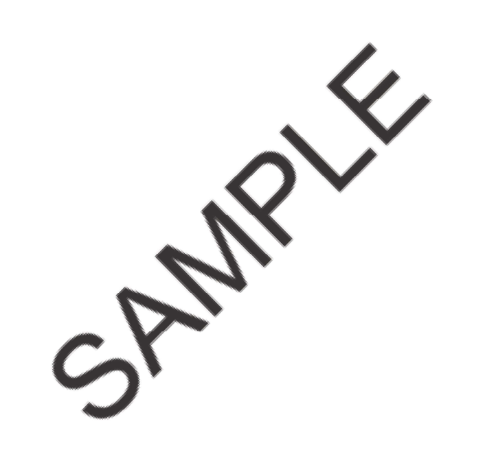
EXHIBIT A, SCOPE OF SERVICES