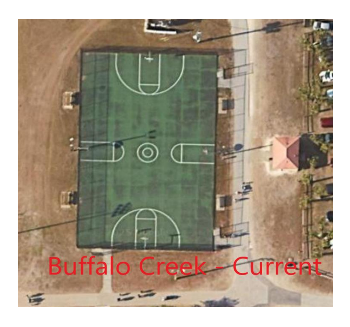
EXHIBIT 3 – PROJECT MAP