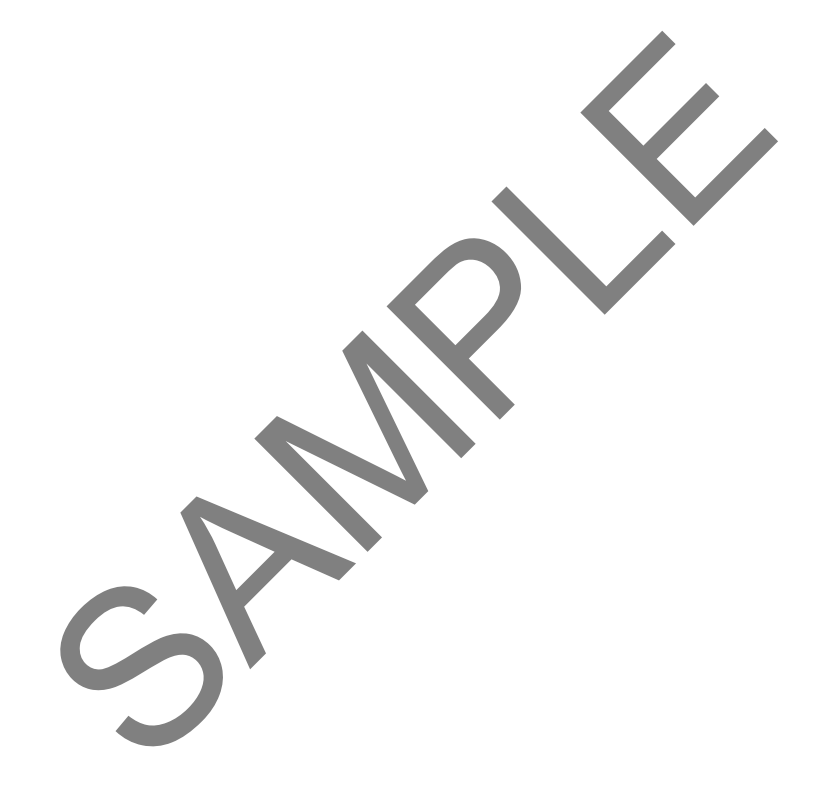
Exhibit A <u>Title(s) of Drawings</u>