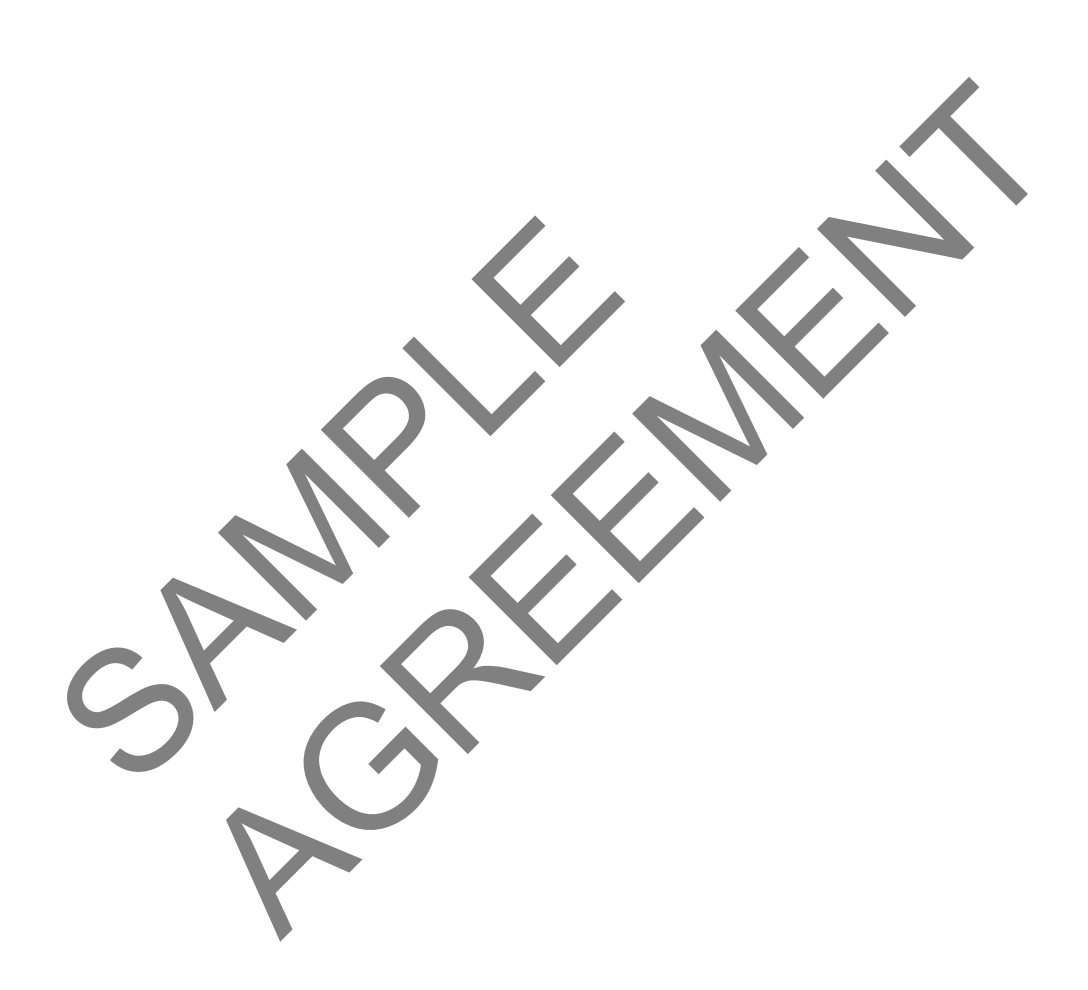
EXHIBIT A SCOPE OF SERVICES