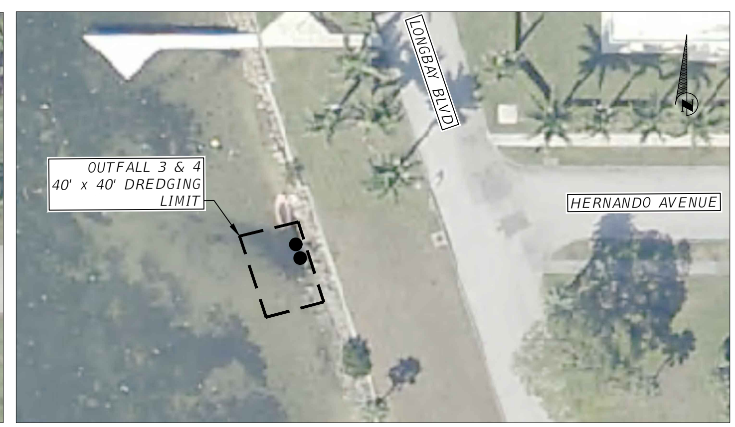
LOCATION 2 LOCATION 1